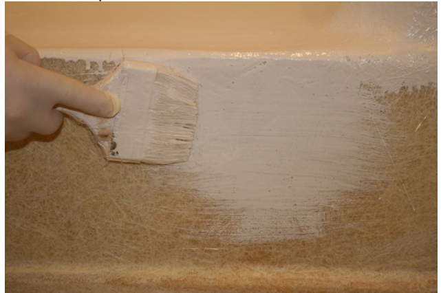
Remove drips and runs

Spread the drips before they begin to cure. It is not necessary to remove them by wiping with a solvent. Excess drips or build-up will have an adverse effect on the lay-up process, such as creating air pockets and bubbles.