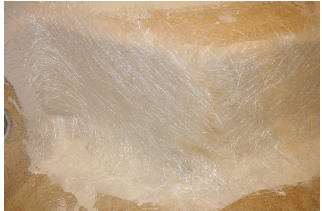
Apply several pieces of mat to resin area

Apply smaller sections in restricted areas.