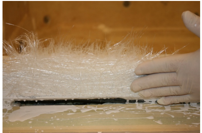
Stage Two (apply mat)

With the resin still wet, immediately apply the piece of mat over the resin allowing it to soak into the mat. Apply two feet sections each time. Be sure the straight cut edges are trimmed and do not have strands projecting from the edge. Align the edge to be even with the substrate's straight edge for uniformity.