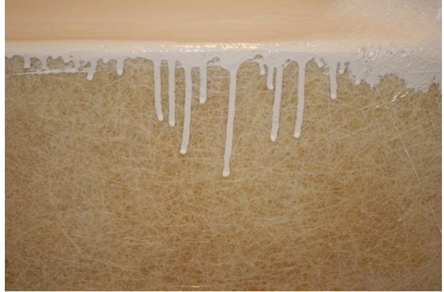
Remove drips and runs

Note: Throughout the process, when the resin drips from the brush onto the working surface, be sure to remove the drips while the resin is still wet.