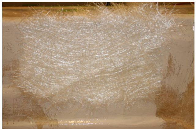
Stage Two (apply mat)

Do not overlap contours or radii, since this might create air pockets and bubbles. Allow the torn mat edges to feather into the radius as a stopping point for the mat. The next adjacent piece will feather into the same radius, laying and feathering onto the adjacent piece. This provides a smooth transition from one piece to the next.