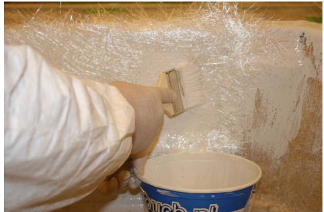
Stage Three (apply resin over mat)

This will yield a seamless surface from one area to the next.