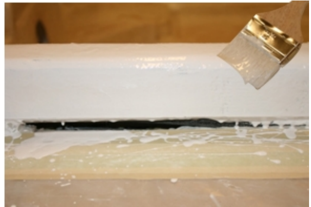
Stage One (apply resin)

The lay-up process is started on the lip or outside edge of the spa. With a two-inch brush apply a generous amount of resin to the surface area, which is a little larger (a few inches) than the mat size to be used. The resin will be applied wet enough to prevent excessive running but have a good gloss.