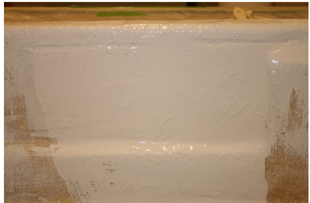
Stage One (apply resin)

Stage One: Apply catalyzed FRL Resin on an area larger than the piece being applied.