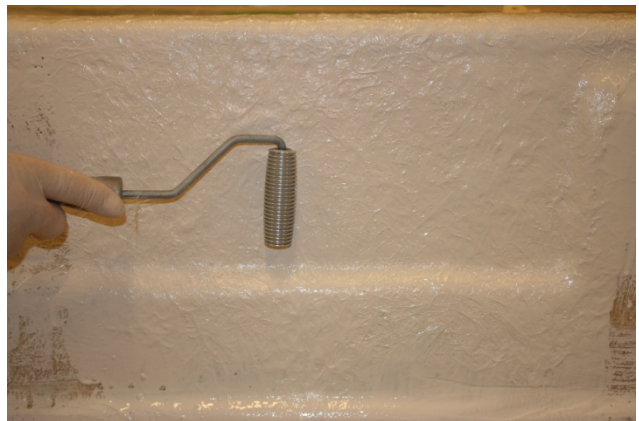
Stage Four (roll-out)