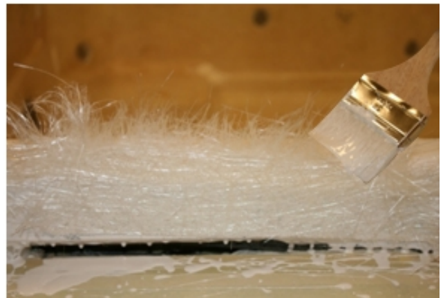
Stage Three (apply resin over mat)

With the same resin mixture and brush, apply more resin over the unsaturated mat.