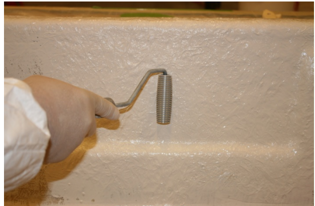
Stage Four (roll-out)

The previous resin application will cure behind you as you proceed with each new piece of mat.